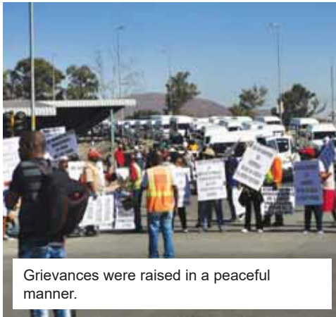
Grievances were raised in a peaceful manner.